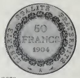
Lot No. 2673

2673 50 Francs, 1904 A. Similar. Gad.261, Fr.328. Some scattered, light marks. A scarce denomination. Brilliant Uncirculated. (1,500–1,750)